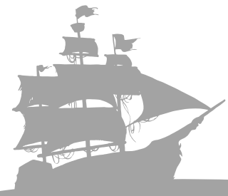
Chart your course to graduation and sail to success!