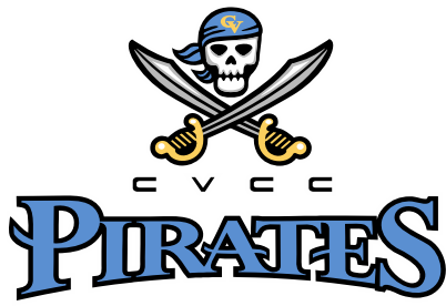
Chart your course to graduation and sail to success!